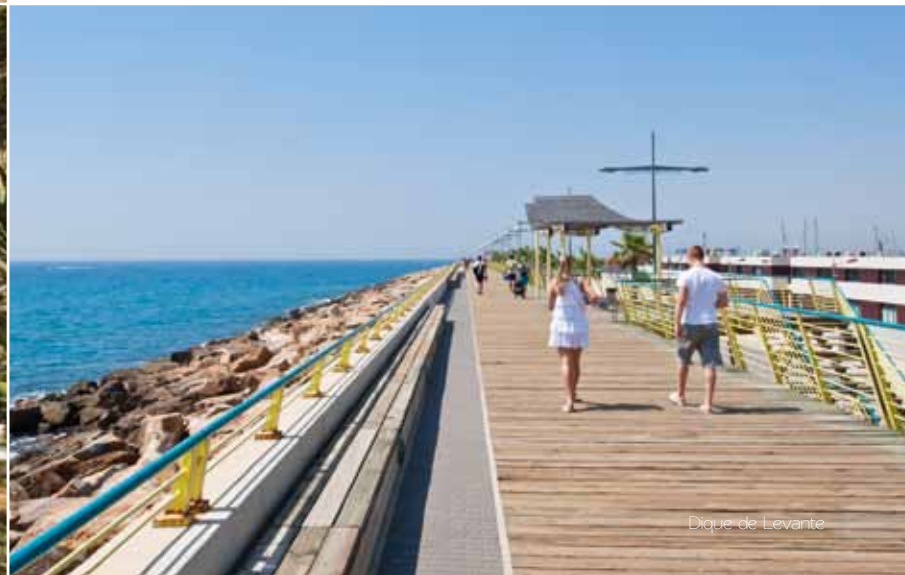
Dique de Levante