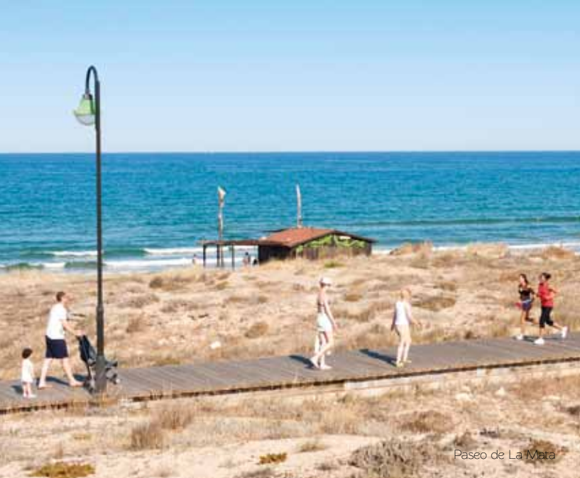
Paseo de La Mata

At the point where the Paseo de Juan Aparicio meets the Paseo de la Libertad, you will see the Paseo del Dique de Levante, a pleasant route just a little over a kilometre long, leading into the harbour bay. If you look inside, you will be able to see the three existing yacht facilities; the city with more mooring points than any other in the Community of Valencia. If you have a boat and you want to visit Torre Vieja, you can rent a temporary mooring point. This is a great way of visiting our city.