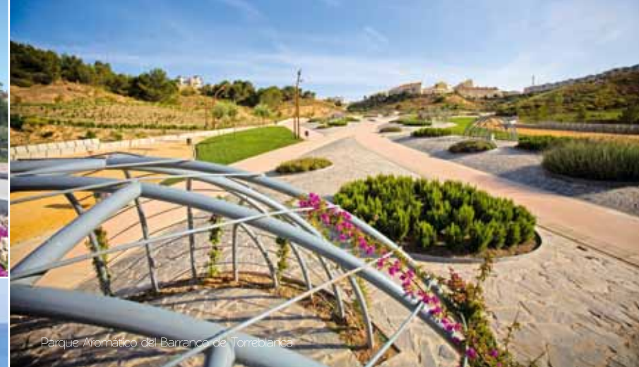
Parque Aromático del Barranco de Torrelblanca