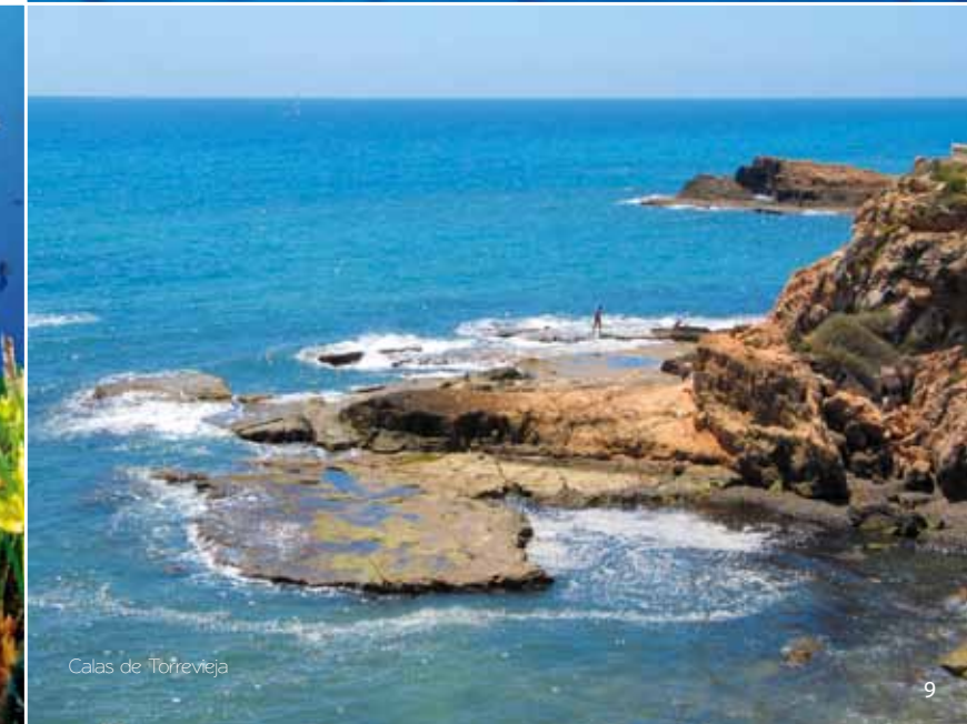
Calas de Torrevieja