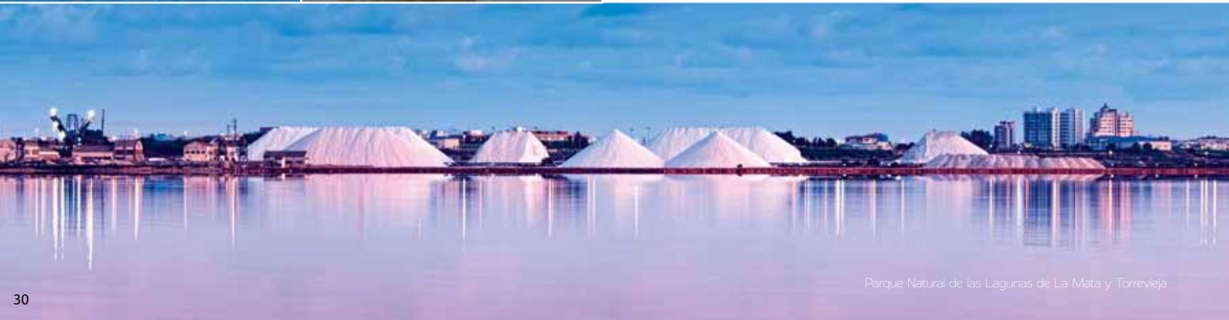
Parque Natural de las Lagunas de La Mata y Torrevieja

In this natural space we find an incredibly unique vegetation, which results from the high saltiness of the ground and the low rainfall levels. The salt marsh communities contain species, such as the Salicornia , Rushes , Calamus , Esparto and Houseleeks . Bird life is the most important faunal group, with nearly a hundred species. Depending on the time of year, you can see various migratory, over-wintering and nesting birds which complete their biological cycle in this wetland.