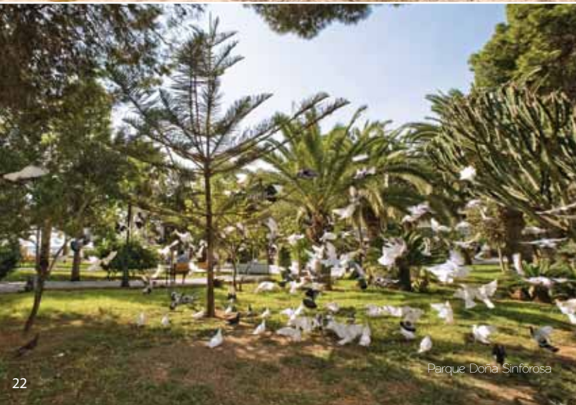
Parque Doña Sinfarosa

There are other avenues which run along the sea front, such as the one next to the International Marina in honour of the master sail maker Juan bautista Buaes, the Paseo Juan Bautista Buaes, and the Paseo de La Mata, which is long and particularly beautiful.