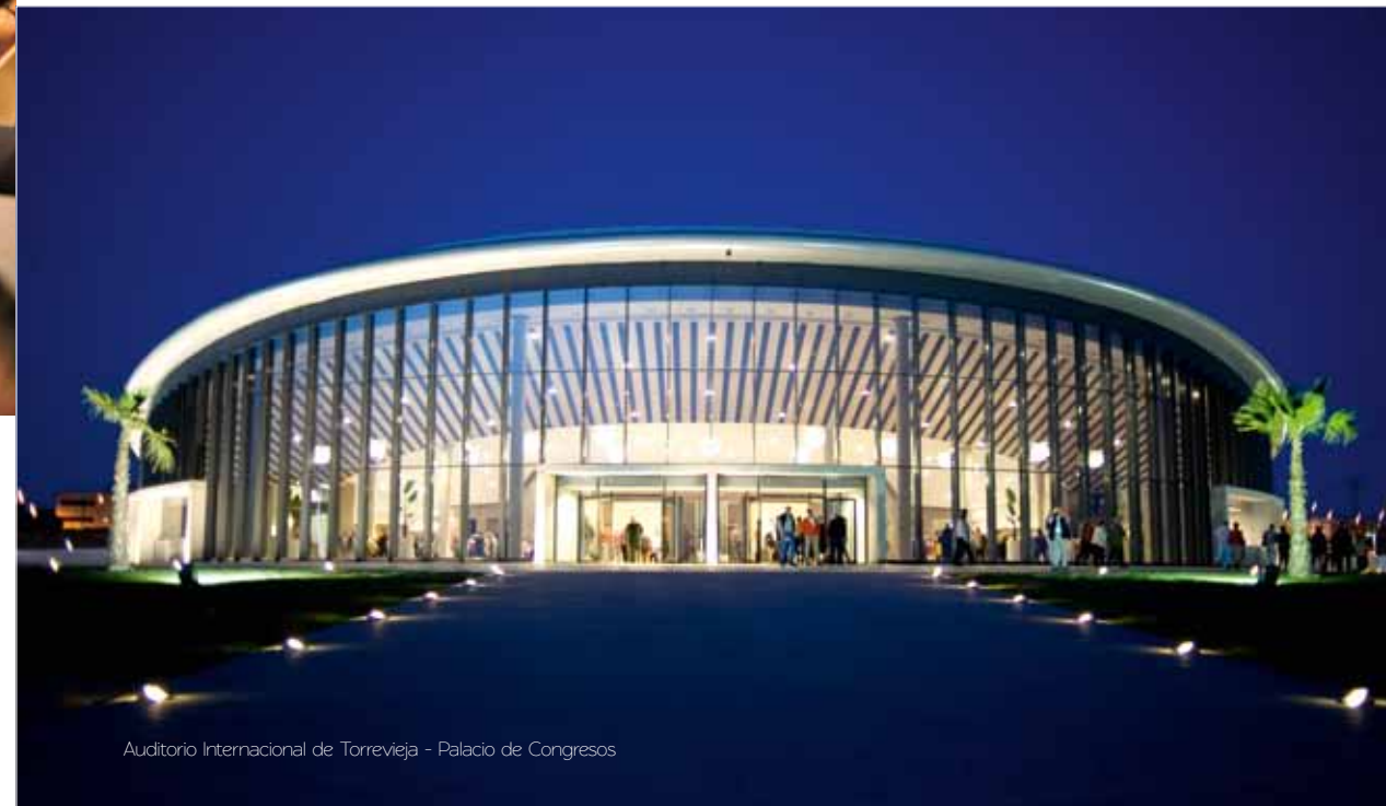
Auditorio Internacional de Torrevieja - Palacio de Congresos

International Auditorium and Conservatory of Music. Partida de la Loma, s/n.