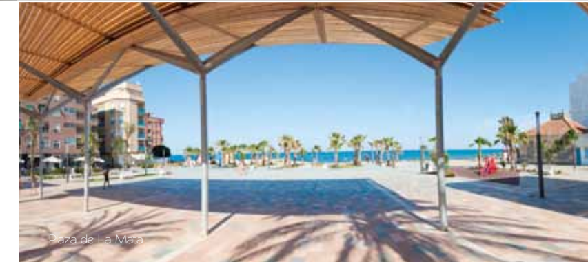
Plaza de La Mata

From the many plazas and parks in the city, we would particularly highlight: Parque del Rincón de Asturias, Parque del Salinero, Jardín del Mediterráneo, Parque de Antonio Soria, Plaza Castelar, which used to be called Plaza de las Barcas, Plaza de la Marina Española and the Plaza de María Asunción. Near to the port you can find the Plaza Waldo Calero, with ceramic benches inspired by the continuous and irregular waves of the sea, and a fountain which cools down this busy spot.