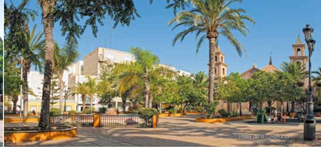
Plaza de la Constitución