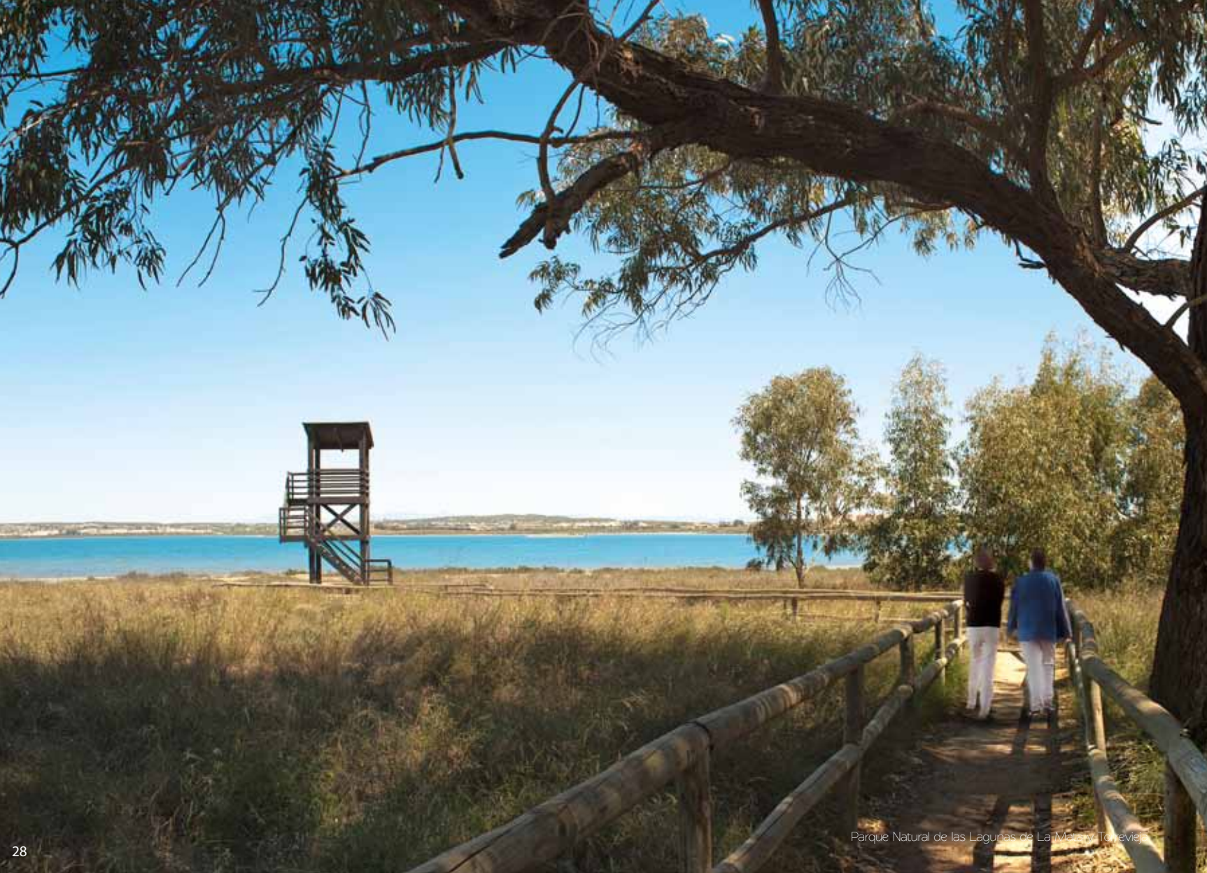
Parque Natural de las Lagunas de La Mata y Torrevieja