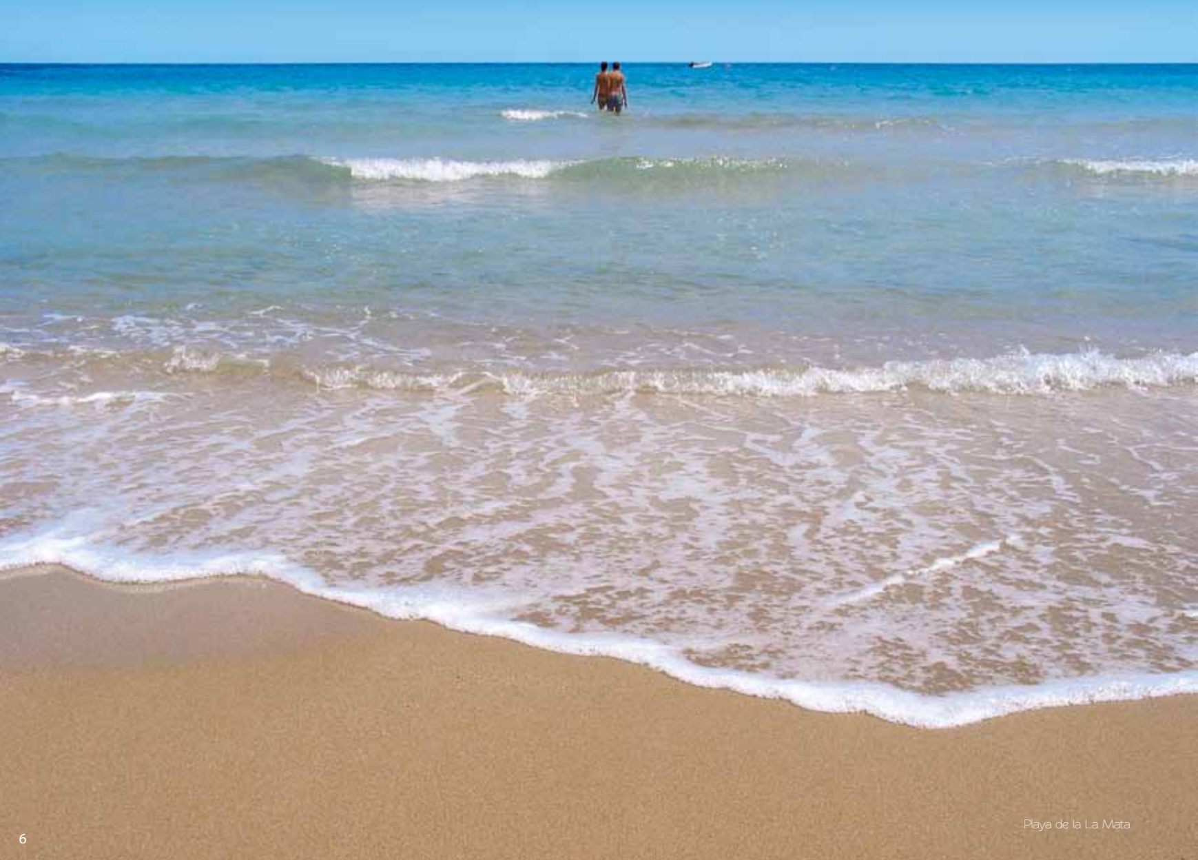
Playa de la La Mata