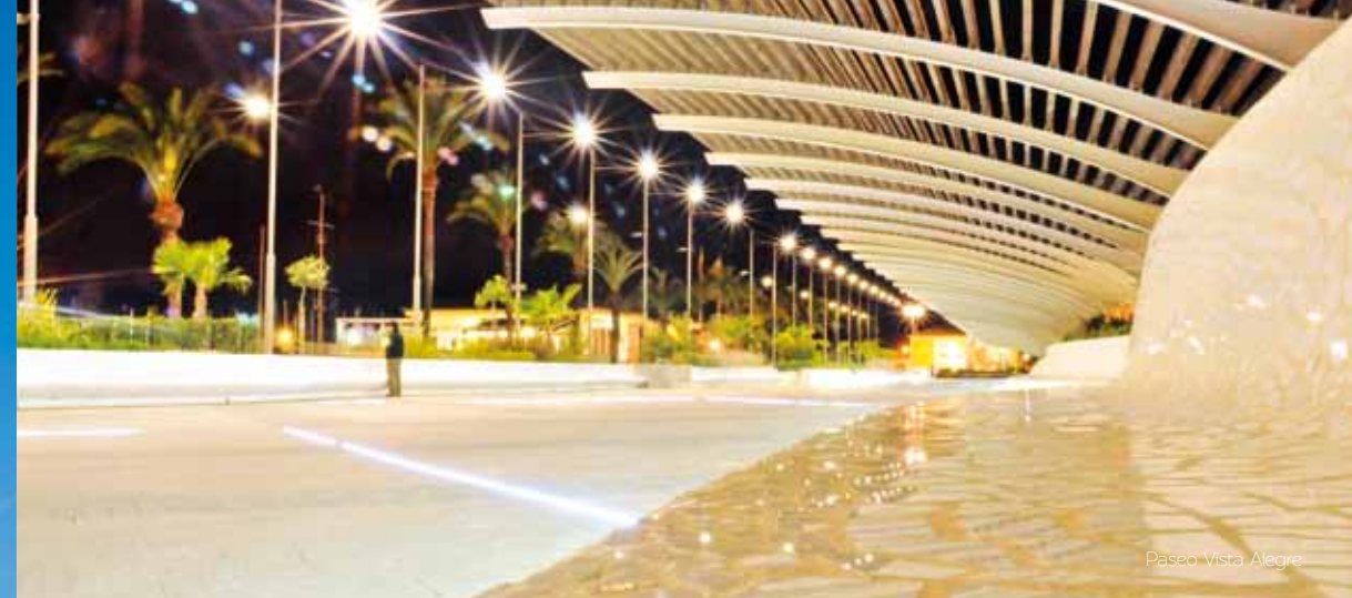
Paseo Vista Alegre