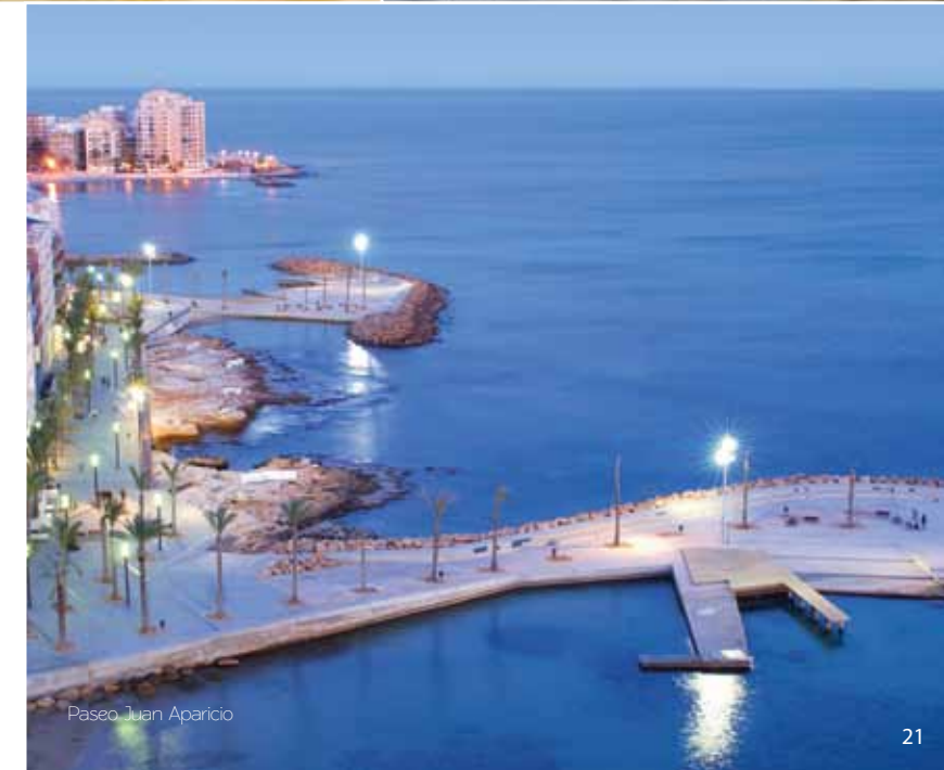
Paseo Juan Aparicio