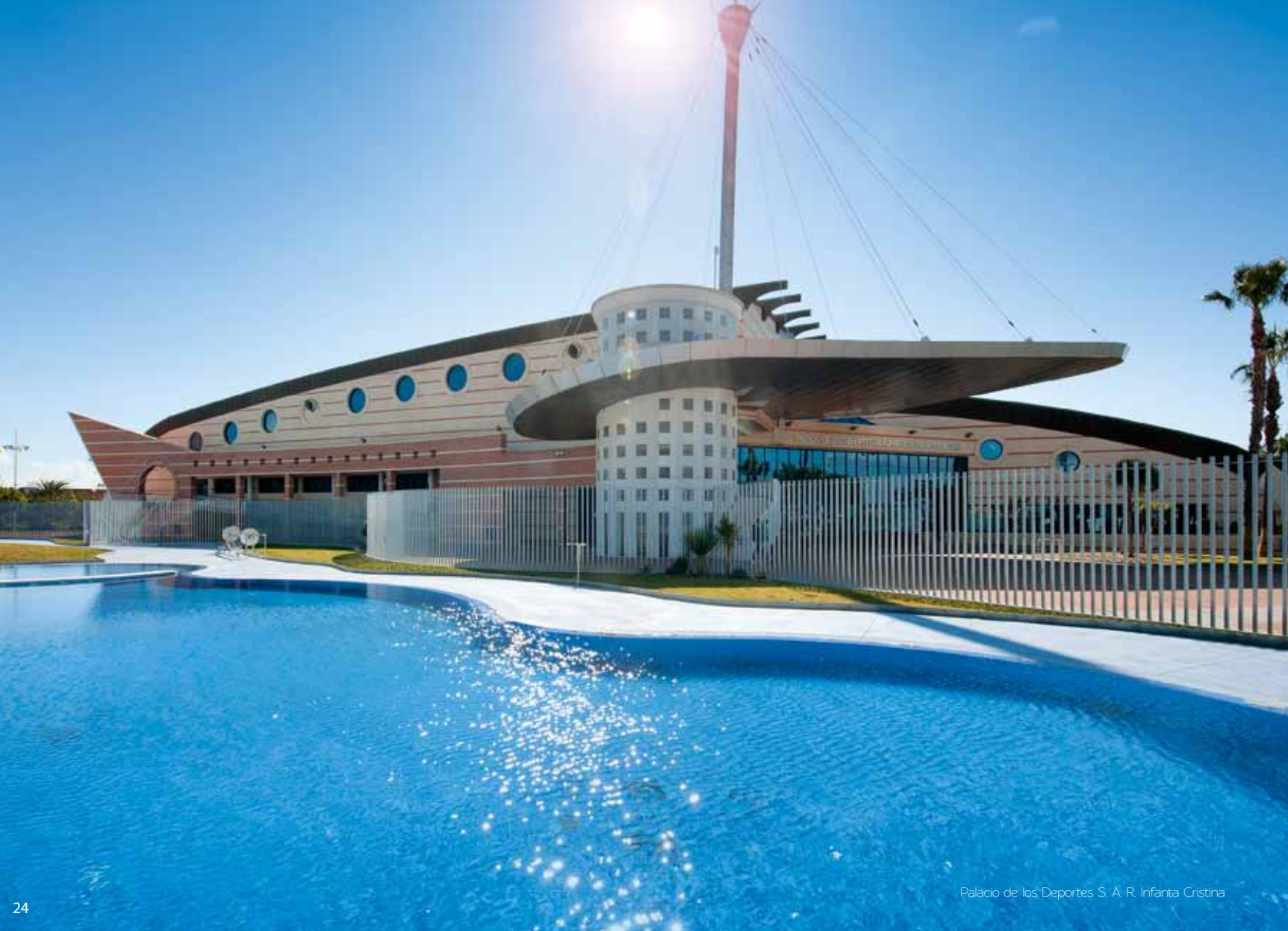
Palacio de los Deportes S. A. R. Infanta Cristina