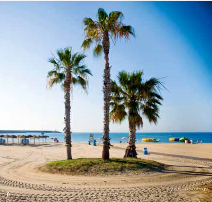
Playa de los Náufragos

Adjacent to the Western dock in the Torrevieja harbour, is the Playa de los Náufragos (Shipwreck Beach), an extensive beach where you can complement a beach day with a fun snorkelling trip. Also, just a few metres deep, towards the North, - the port- or the South -La Veleta town-, there are posidonia meadows with fascinating ecosystems that we recommend you take a look at whilst respecting the environment. If you go snorkelling in the "La Veleta" area, notice how there are sections of tiles at the bottom. Curious? You should know that the Playa de los Náufragos owes its name to the shipwrecks which took place nearby. In the 19th C and the beginning of the 20th C, Torrevieja was a true shipping dream, with many ships which traded with the Caribbean ports, such as La Habana. On many of these crossings, the Torrevieja ships departed with tiles. After a shipwreck these often settled on the sea beds: that is why there are tile remains in some areas.