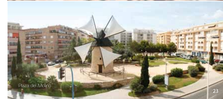
Plaza del Molino