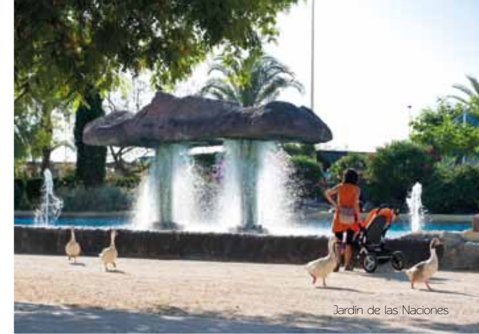
Jardín de las Naciones