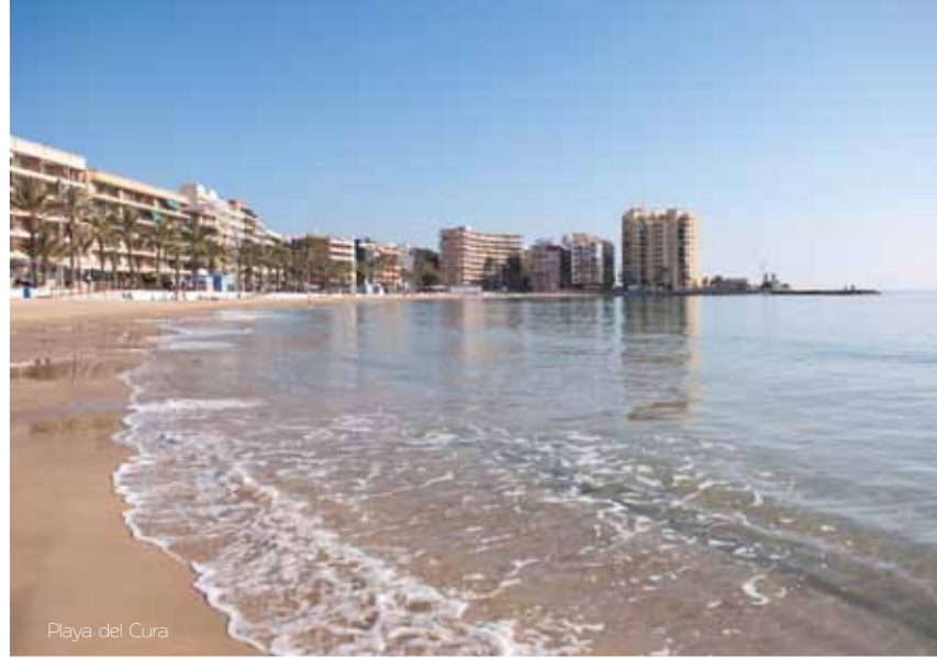
Playa del Cura

If you are lucky, you will be able to sample the “famous” Torrevieja dry octopus in one of its kiosks, which must be accompanied by a fresh “paloma”. If you continue South, towards the centre of Torrevieja, you will pass by the Cala or Curva del Palangre and Punta Margalla, home to the Monumento a las Culturas del Mediterráneo (Monument to Mediterranean Cultures), an area commonly known as “Las Columnas” (The Columns). From this landmark, you will be able to see the city’s most famous beach, Playa del Cura. We must point out the great quantity of services provided for tourists here, with numerous restaurants, refreshment stalls, kiosks, etc., where you can cool down and enjoy yourself in between swims. A perfect beach to enjoy a different day out with the family.