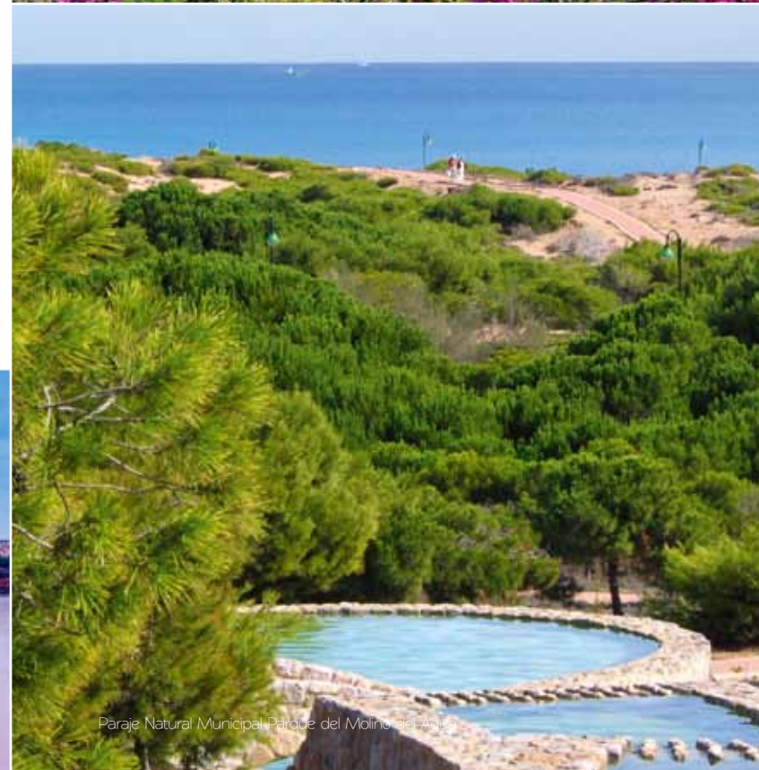
Paraje Natural Municipal Parque del Molino del Agua

Parque Aromático del Barranco de Torrelblanca, ("Torrelblanca Aromatic Park") is a unique environmental landscaping project designed by the acclaimed Catalan architect, Carmen Pinós. Boasting a total area of some 70,000 square metres, this is the perfect open space in which to take a stroll and enjoy its natural beauty. Don't be surprised if the fragrances remind you of a spice market! One of the peculiarities of this park is that it has been planted almost entirely with aromatic species such as thyme, rosemary, basil or lavender. Take a deep breath and discover one of Torrevieja's latest charms.