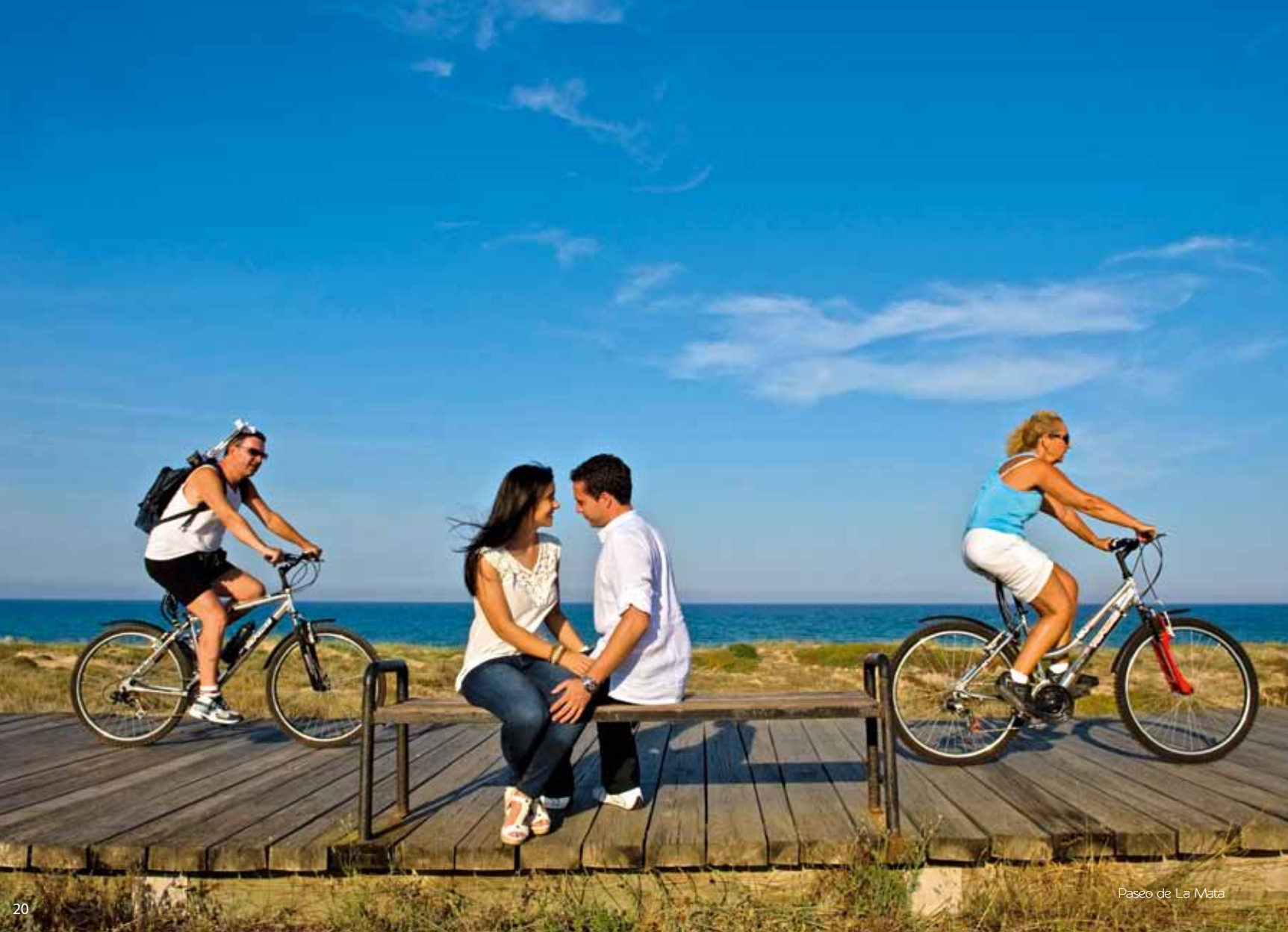
Paseo de La Mata